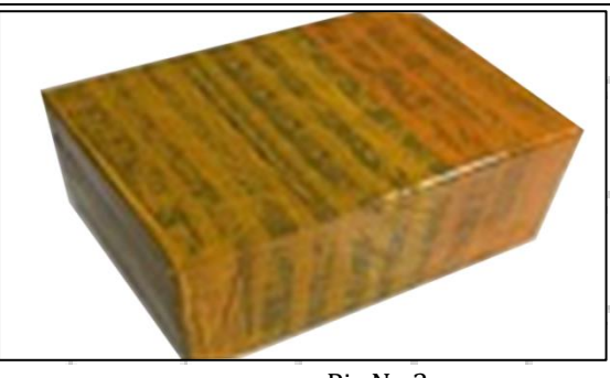
Pic No.3 International express packaging: Wrapped with yellow tape after wrapping black protective film